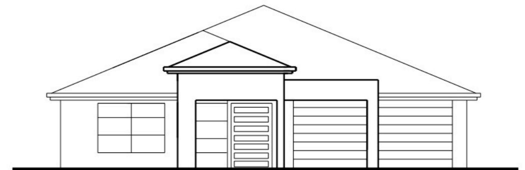
FRONT FACADE OPTION